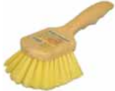
SE601 Our favorite with easy grip handle & firm bristles.