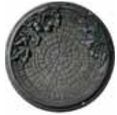
OPUS8150 Cobblestone Hanging Birdbath