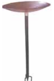
SEWS60066 Copper & Iron Birdbath - 19" bowl