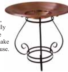
SEWS60054 Copper Birdbath with Iron Stand

Beautiful - Yet functional, we had the surface especially "stamped" to improve the bird's ability to stand, and make the baths heavy for years of use.