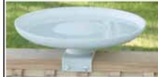
ALLIEDPRK67301 Deck Mount Birdbath