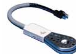
ALLIEDPR300 200 Watts-Birdbath De-Icer.