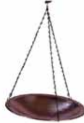
SEWS60007 Copper Hanging Birdbath