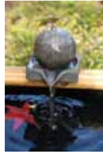
Bamboo Pump Kit

Motion on the water's surface or the noise of falling water is like a magnet to the birds. Add one of our bamboo or brass pump kits, and move water in any bath, barrel, or pond.