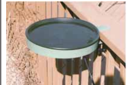
FIBD70-Terra-Cotta Birdbath FIGBD70-Green Birdbath