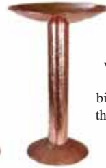
SEWS60008 Copper Standing Birdbath

Beautiful - Yet functional, we had the surface especially "stamped" to improve the bird's ability to stand, and make the baths heavy for years of use.