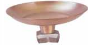
SEWS60065 Copper Birdbath