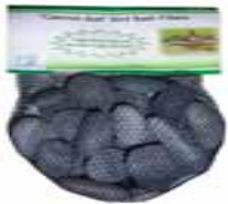
SE7017 Cannonball Bird Bath Fillers - "Helps birds feel safe in any birdbath."