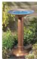
Solar Powered Copper Birdbath