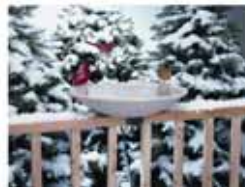
ALLIEDPR650 Deck Tilt and Clean Heated Birdbath

We like the "Raised Island" in Kozy baths, as well as their "Heavy, Rugged Construction."