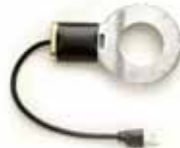
FIC50 150 Watts-A Top Seller- We think it's because it looks rugged.