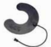
ALLIEDPRK19501 Kozy Bird Oasis 14" Curved.