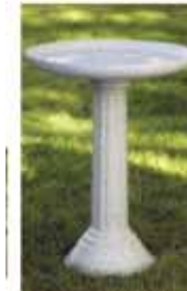
ALLIEDPRK570 Kozy Bird Spa Heated Birdbath with Pedestal