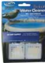
BIO10150 Birdbath Water Cleaner