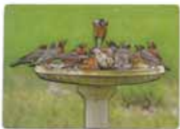
SE7024 Magnet helps hold special artwork or memos to refrigerators, file cabinets, etc.