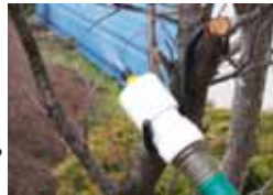
SE7019 Songbird Essentials Easy Mister

through the mist, you can attract warblers (who don't normally visit feeders) and many other birds to stop by for a refreshing "Leaf Bath." Watch how they use the wet leaves as a "wash cloth."