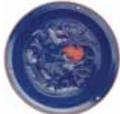
OPUS4103 Lily Pad Hanging Birdbath