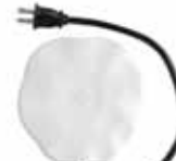
FIHR75 75 Watts-The Heated Rock Birdbath De-Icer.