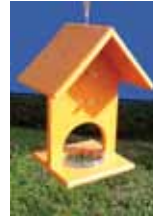
SERUBFJF Fruit & Jelly Feeder