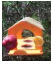
SERUBGRAND Grand Slam Feeder