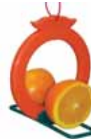
SE6005 Double Orange Feeder