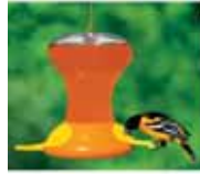
SEBCO230 30 oz. Oriole Feeder