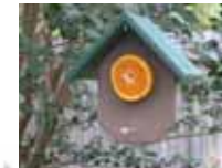
SERUBFR100 Fruit Feeder