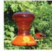
SEBCO243 48 oz. Oriole Feeder