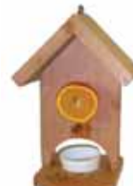
SESCS403 Fruit & Jelly