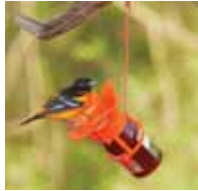
SEBCO212 Jelly/Jam Feeder