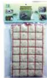
SE7021 Hummer Helper Cage & Nesting Material