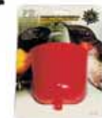
SE609 Nectar Protector