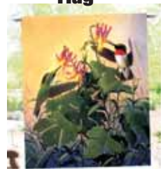
SEEK6610 Morning Visitors Garden Flag