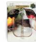
SE608 Nectar Protector