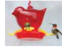
SEBCO312 Red Bird Hummingbird Feeder