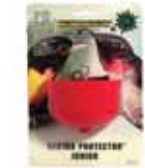
SE621 Nectar Protector Jr