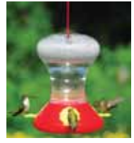
SEBCO360 30oz Hummingbird Feeder