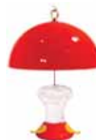
SESQ83R Hummer Helper Hummer Helmet