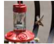
SE6002 16oz Clean Feeder