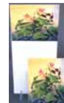
SEEK8510 Morning Visitors Memo Pad