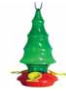
SEBCO316 Conifer Hummingbird Feeder