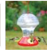
SEBCO352 52oz Hummingbird Feeder