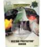
SE620 Nectar Protector Jr