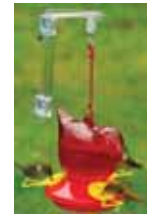
SEBCO312W Window Red Bird Hummingbird Feeder