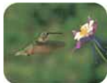
TT99821 - Small TT99822 - Medium