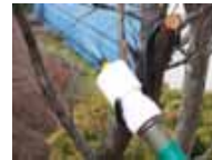
SE7019 Easy Mister