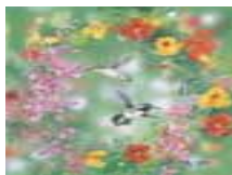
TT93081 - Small TT93082 - Medium