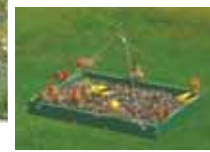
SERUBSPF400H Large Hanging Platform Feeder