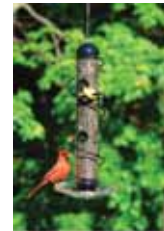
SEBQSBF3E 17" Elegant Sprial Seed Feeder