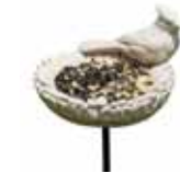
Cardinal & Sunflower Stake Feeder

This beautiful copper standing bath provides a "rough" surface to ensure safe footing, and high enough to help prevent attacks from cats.