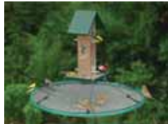
SEIA13921 30" Seed Hoop

Save more seed with Songbird Essentials Seed Hoop.