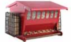
Seed N' More Feeder-Red

Cardinals are "ground" feeders; however, they will feed on flat surfaces. Wood platform feeders (hopper, fly through and open platform) placed five feet or so above ground level are ideal to attract them. Note that the perches on most tube feeders are too small to allow Northern Cardinals to comfortably feed. To attract Cardinals you must attach a tray, and we have a tray for nearly every tube feeder made!!