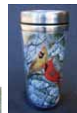
SEEK7501 Thermal Mug