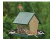
SERUBHF75 Large Hopper Feeder