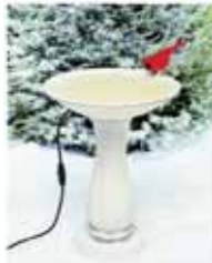
Heated Bird Bath