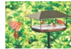
Champion Squirrel Blocker Platform Feeder