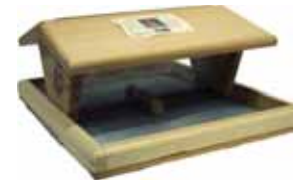
SESC2005C Vista With Hopper