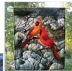
SEEK6603 Fire In The Snow Garden Flag