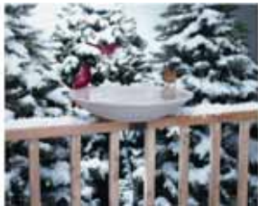
Deck mount bird bath, easy tilt and easy clean. Heated and non-heated available.

Like most other birds, having a year-round water source is a great help in attracting Cardinals. A few favorites Cardinals love include: