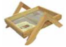
SESC1012C Small Ground Feeder "A" Leg