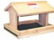
SESC1015C Fly Thru Feeder