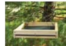
SESC2007C Hanging Feeder