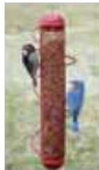
SEBQSBF4R Bluebird & Downy Woodpecker eating Kernels from a Songbird Essential Spiral Feeder