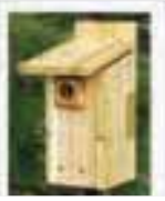
SESC3004RW Ultimate Bluebird House